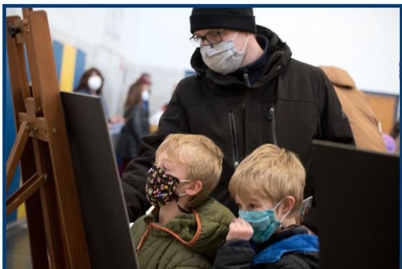
Students and parents explore the architect's renderings