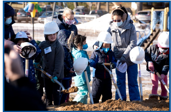
Families joining in the groundbreaking