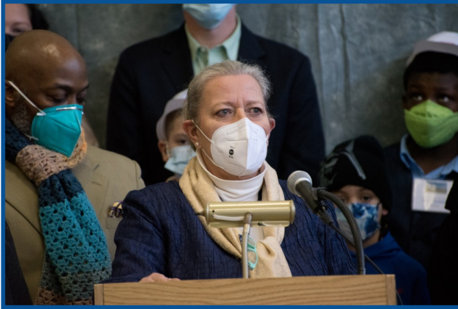
Mayor Liz Pendleton speaks to the audience