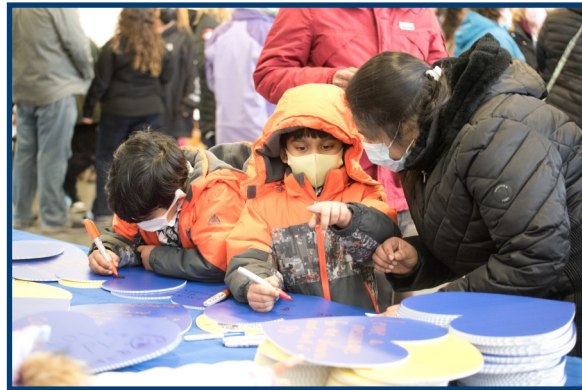
Parents and students sign well wishes for PV