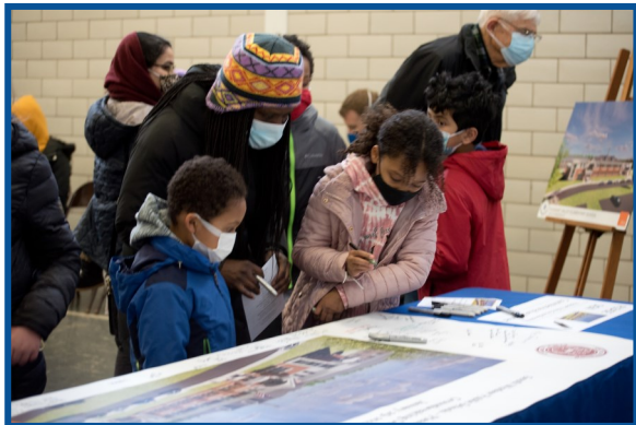
Students sign commemorative banner