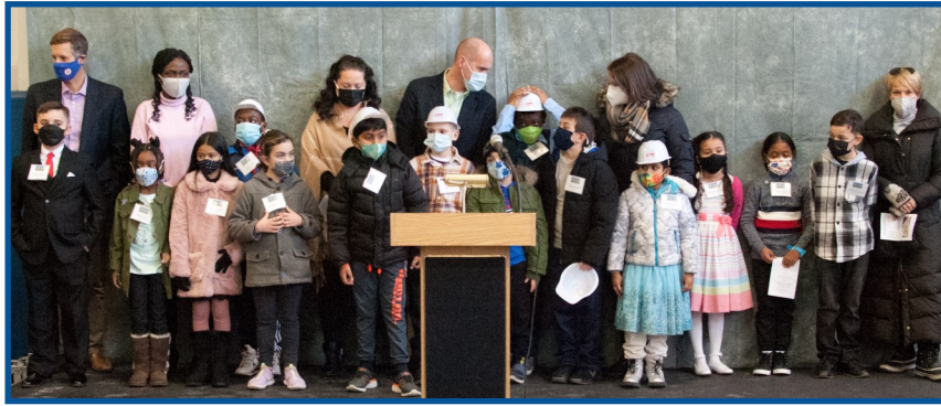
Student ambassadors from all four elementary schools participated in the ceremony